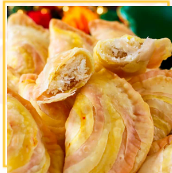
ROSE COCONUT KARANJI