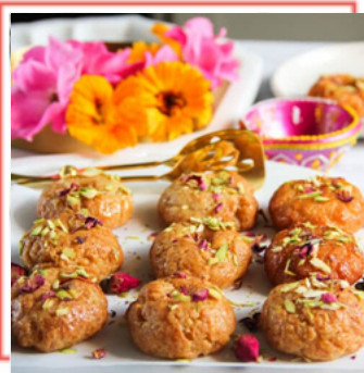
AIR FRYER BALUSHAHI