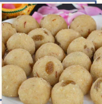
RAVA COCONUT LADOO